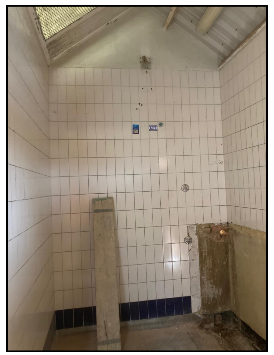
Photo of room at start of a recent 'Space to Change' project Henley-on-Thames, Oxfordshire

'Space to change' facilities can also be created within an existing building where 12m^2 rooms are not feasible due to space restrictions. These bridge the gap between a fully operating Changing Places facility and a standard Document M DDA compliant facility. The equipment of a Changing Places facility is installed within a 3m \times 2.5m space to allow off the floor personal care.