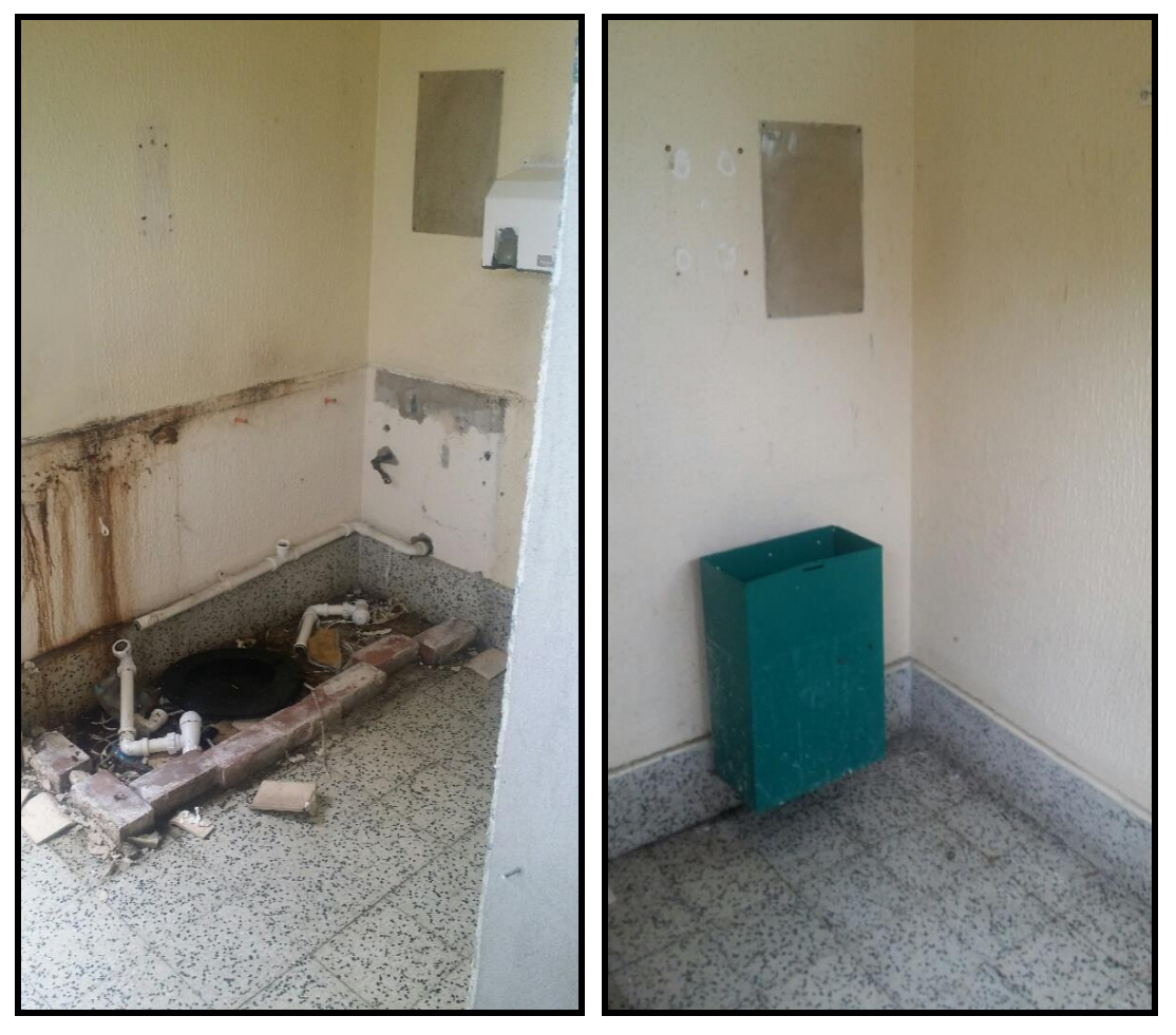
After photo of completed project Tenby Pembrokeshire